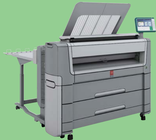
MULTIFUNCTION SYSTEM WITH OPTIONAL OCÉ DELIVERY TRAY AND OPTIONAL MEDIA DRAWER