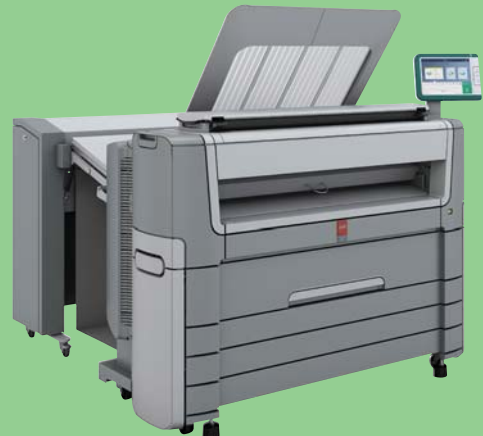
MULTIFUNCTION SYSTEM WITH OPTIONAL OCÉ 2400 FANFOLD