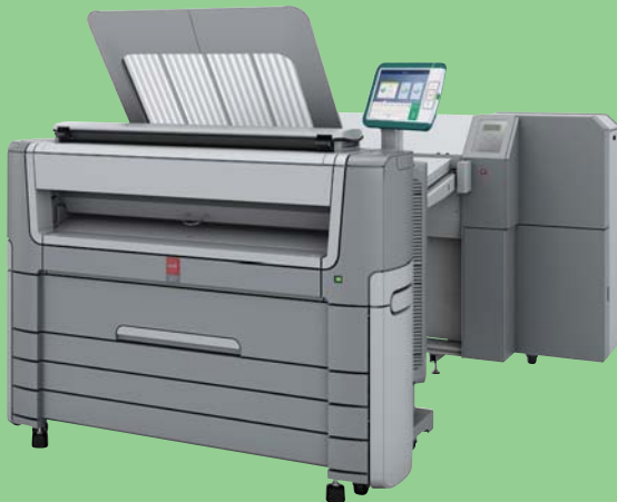
MULTIFUNCTION SYSTEM WITH OPTIONAL OCÉ 4312 FULLFOLD