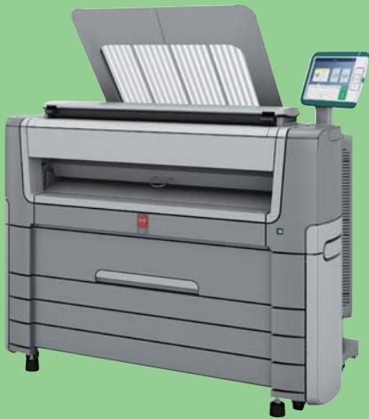
WITH OPTIONAL SCANNER EXPRESS II (MULTIFUNCTION SYSTEM)

Being able to submit files to your large format printer from anywhere can give you a big advantage when time is tight and deadlines are looming. The Océ ClearConnect software suite gives you more flexible ways to submit files to the printer. Print from your desktop via Océ Publisher Select™ software to manage complex document sets. With Océ Publisher Mobile, print from your smartphone or tablet when you are rushing to a meeting. Knowing you can print when you need to, can take some of the stress out of your work day.